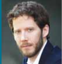
Aron Ralston Mountain climber and adventurer was the inspiration for the Academy Award Nominated film "127 Hours"