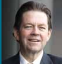
Dr. Arthur Laffer Economist and former member of the President's Economic Policy Advisory Board

22ND ANNUAL EVENT NOVEMBER 7-9, 2011 WYNN LAS VEGAS